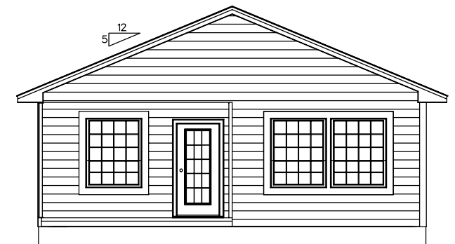
REAR END ELEVATION