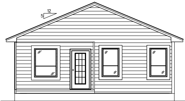
REAR END ELEVATION