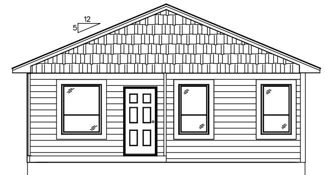
REAR END ELEVATION