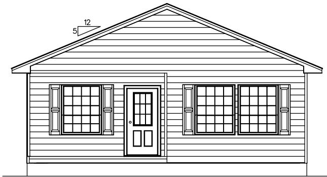
REAR END ELEVATION